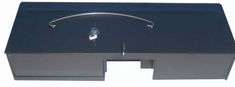
Insert with lockable lid