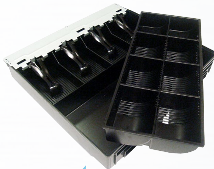
Removable coin tray