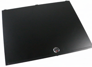
Lockable lid for insert (optional)