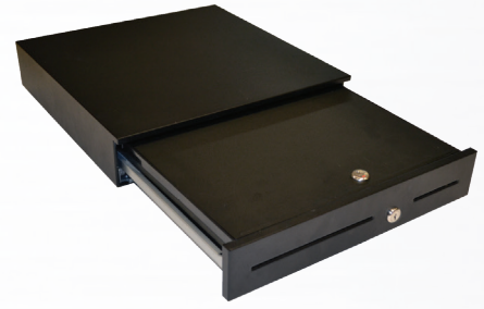
Lockable lid fits inside the cash drawer when closed