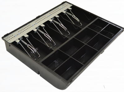
Insert (4 note & 8 coin)