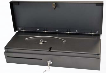
Insert and lockable lid within the drawer