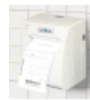
*Available for external AC adapter type only.